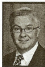
Robert Remond Agency Inc. 6315 Brookside Plz Ste 104 (816) 361-8600 Bus Kansas City, MO 64113 rremond@amfam.com