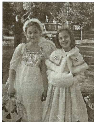
These two young ladies displayed just two of the many creative costumes we saw at the Halloween Party on October 29. For more photos, see page 11.